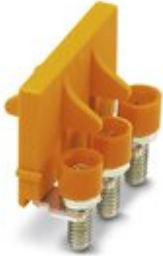
Switching jumper, pitch: 8.2 mm, width: 23.5 mm, number of positions: 3, color: orange

Please be informed that the data shown in this PDF Document is generated from our Online Catalog. Please find the complete data in the user's documentation. Our General Terms of Use for Downloads are valid ( http://phoenixcontact.com/download )